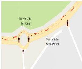
Control-Tower small roundabout