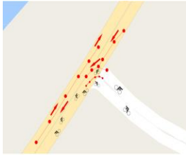
Artemidos Piale-Pasha Junction